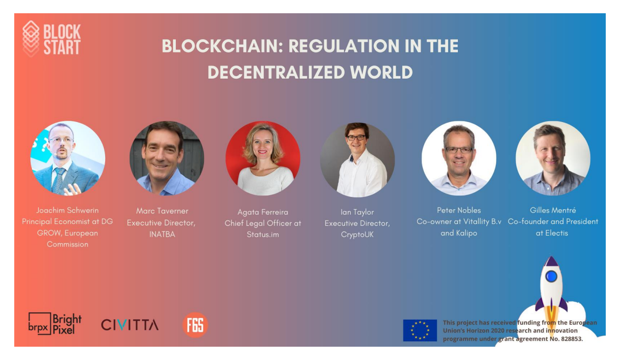
Figure 11 Line-up of the conference speakers on 24th of February 2022